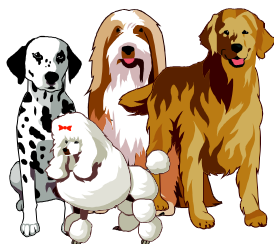
Best in Show or High in Trial

To the highest scoring german shepherd in Trial.