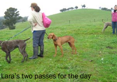
Lara's two passes for the day