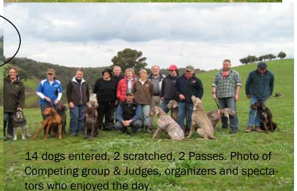
14 dogs entered, 2 scratched, 2 Passes. Photo of Competing group & Judges, organizers and spectators who enjoyed the day.