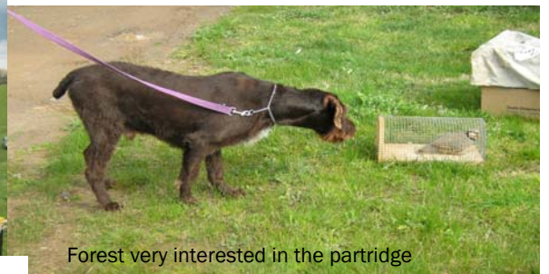
Forest very interested in the partridge